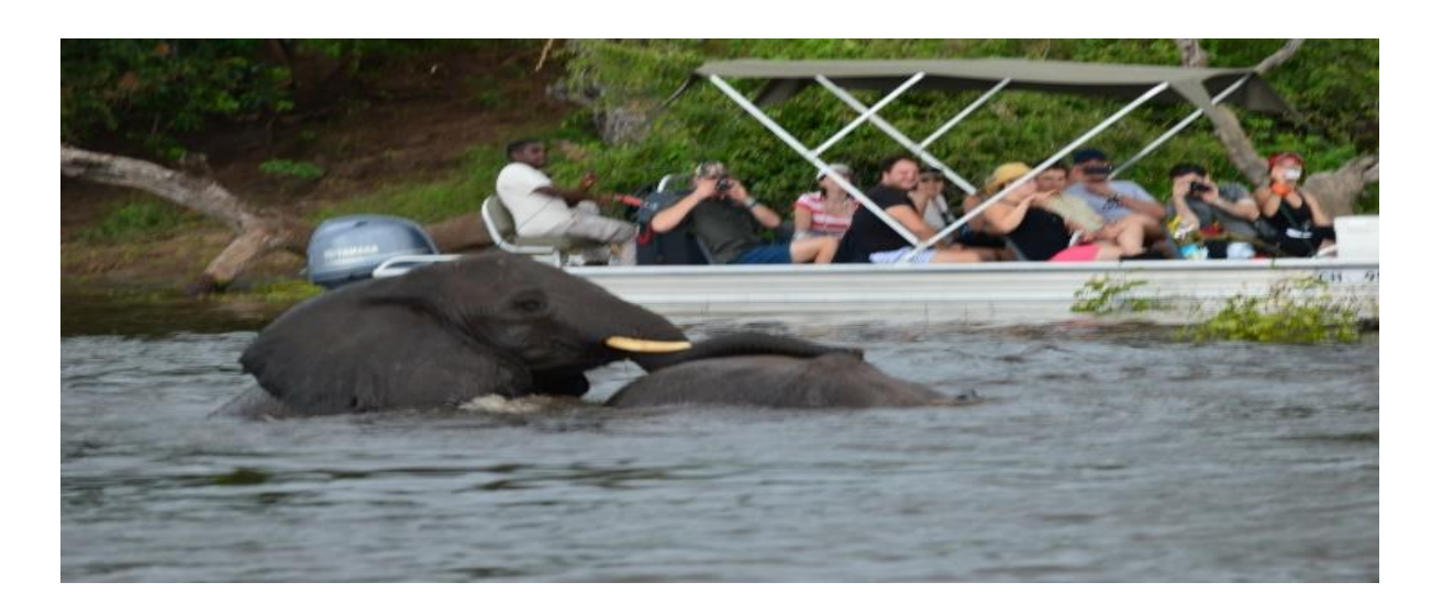
Day 8: Have an early morning breakfast before a transfer to Kasane for a drop off at Zimbabwe border.