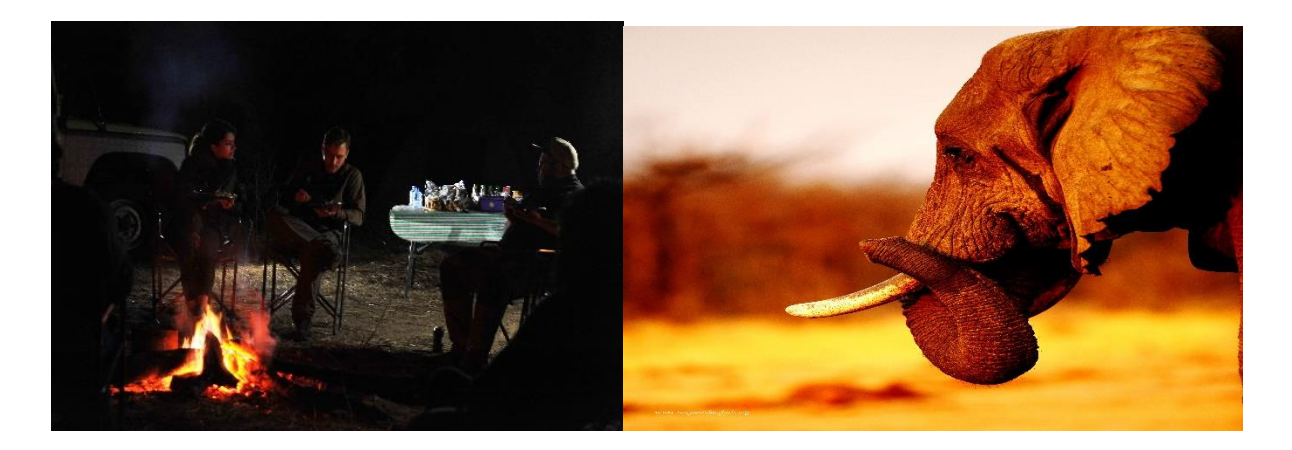
DAY 5: Breakfast is served in the morning then a game drive will follow in which you might view different kind of birds like African fish eagle more especially on tall trees along the river bank, kori bustard which is believed to be eaten by royalty, secretary bird and many more. Lunch will be served at the camp. Have a siesta time. Engage on an afternoon game drive where you will go for rock climbing at bush man rock paintings, dinner will be served at the camp.