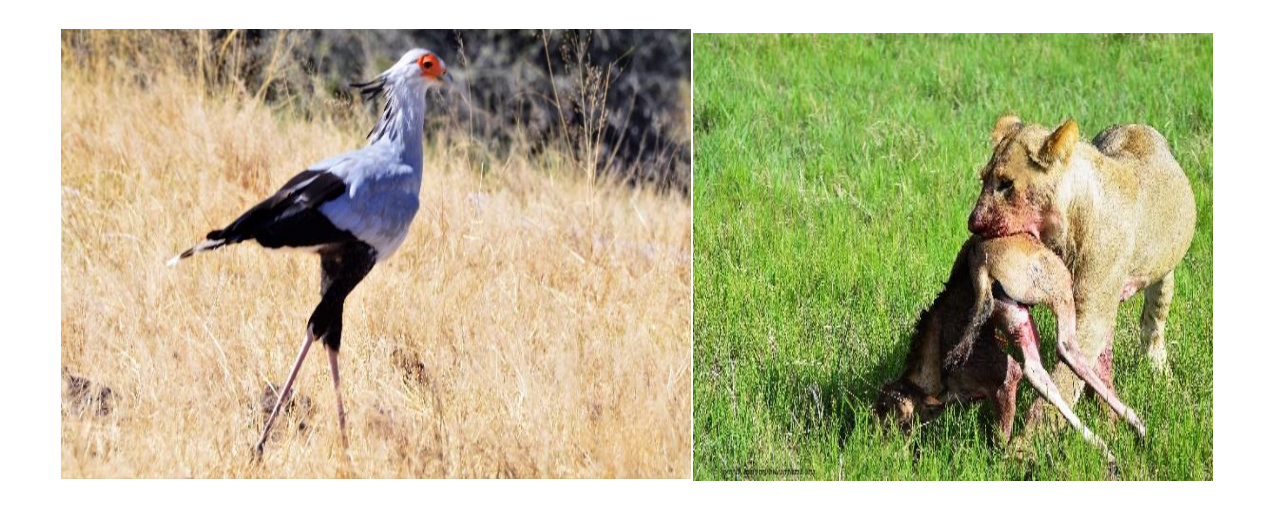
DAY 6: Have a breakfast in the morning and go on a game drive leading to Chobe whereby you will spend a nights under the stars of Chobe which is well known with high concentration of elephants. After lunch you will have time to rest before going on an afternoon game drive for a perfect sunset along the river bank in serondela area. Dinner will be served at the campsite.