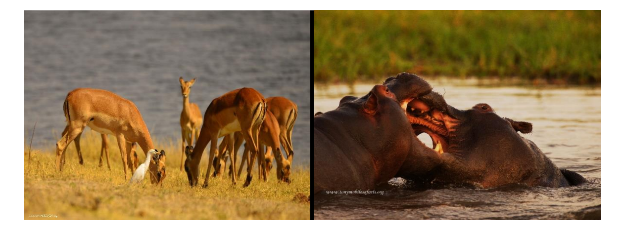
DAY 7 : Have a morning breakfast before going on a game drive leading to Kasane for a boat cruise which takes 3 hours in the great Chobe River where you will go around the Sedudu Island and you might spot elephant swimming across the river. Lunch will be served at the campsite then rest before going for the game drive. Dinner and after nights will be served at the campsite.