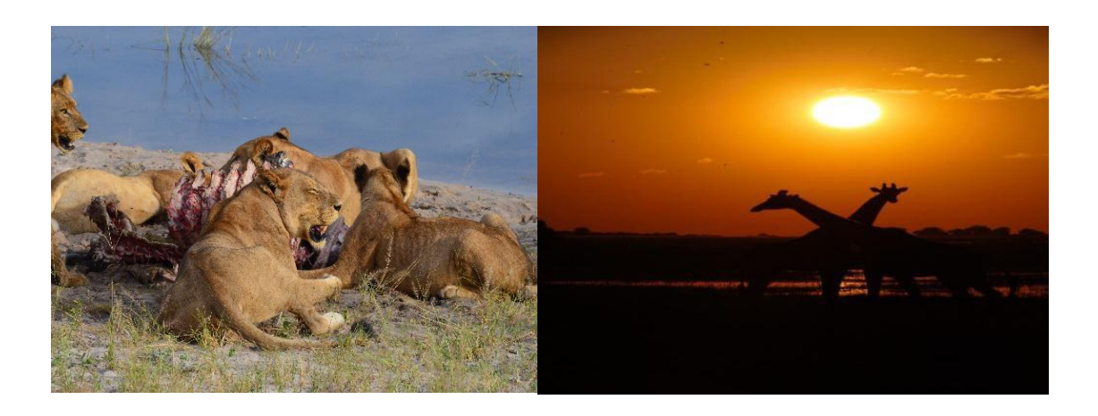
DAY 4: Continental breakfast will be served in the morning before transfer to Savuti where you will spend 2 nights. Game drive will be around the park where you are likely to spot meat lovers and other animals like buffalos, impalas, zebra and kudus as Savuti has a high concentration of animals. Lunch will be served at the camp. After lunch time have a quick shower and rest. An afternoon game drive will follow in which you will view a perfect sunset. After nights and dinner will be served at the camp